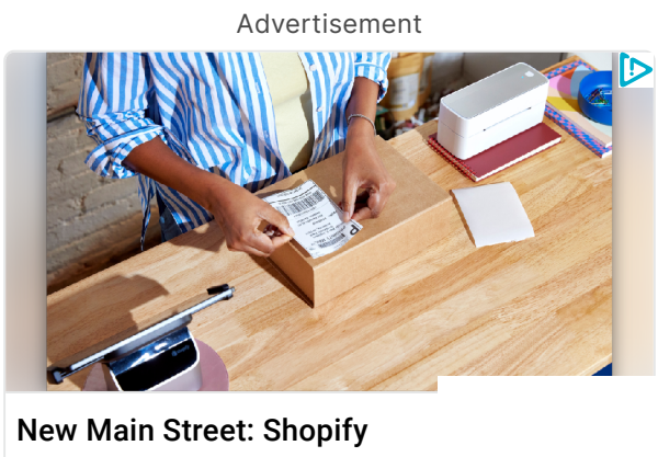
Behind the Sales: How Shopify's Too